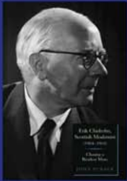
Front cover of Biography